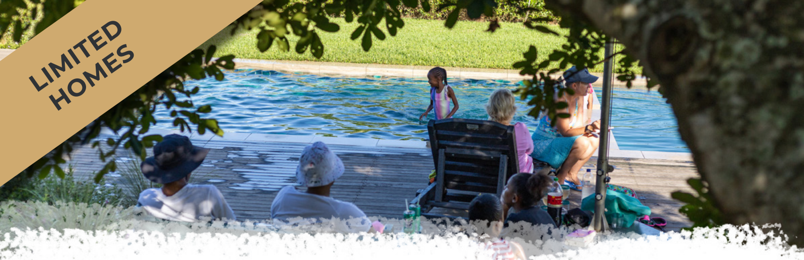
N2 TINLEY MANOR